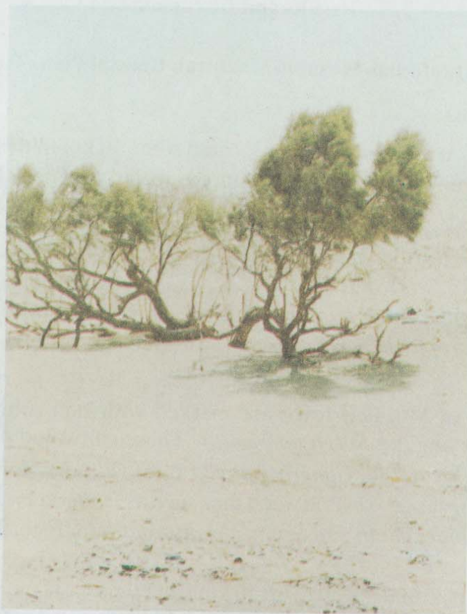
Fig. 2. Tamarix aphylla (L.) Karst. in the vicinity of Al-Gunfudah