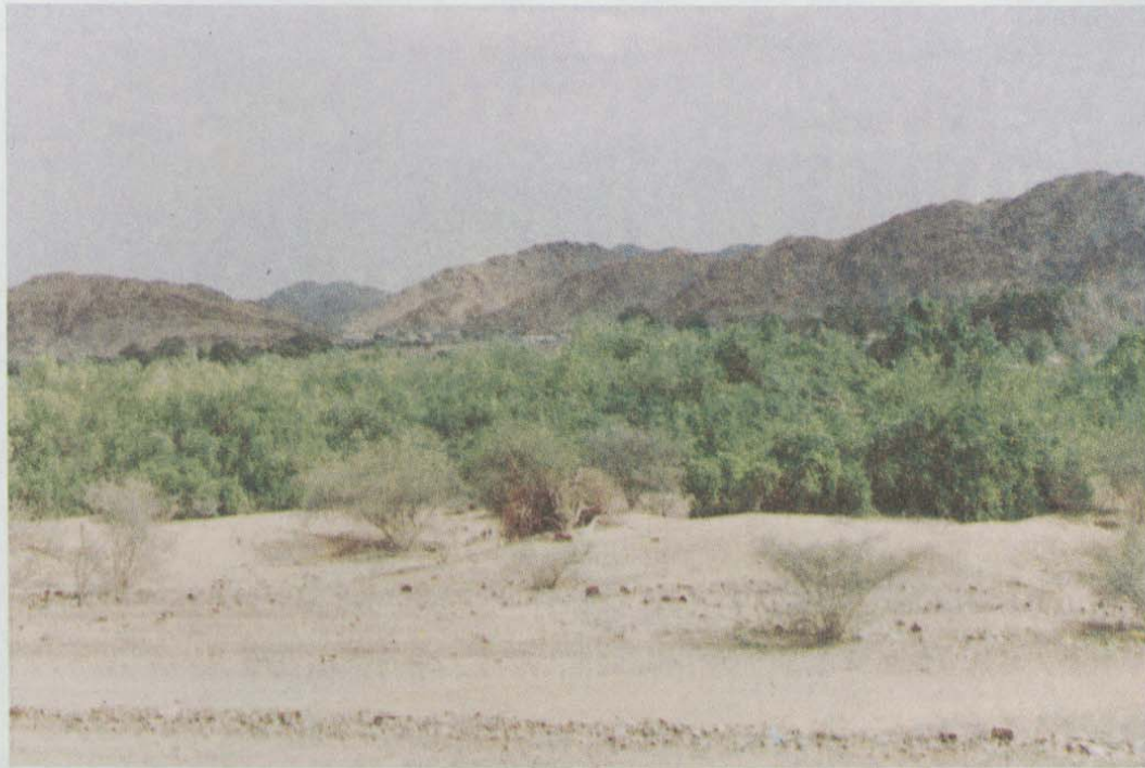
Fig. 4. Acacia tortilis , Ziziphus spina-christi and Salvadora persica in a wadi near Qaryat Nawan