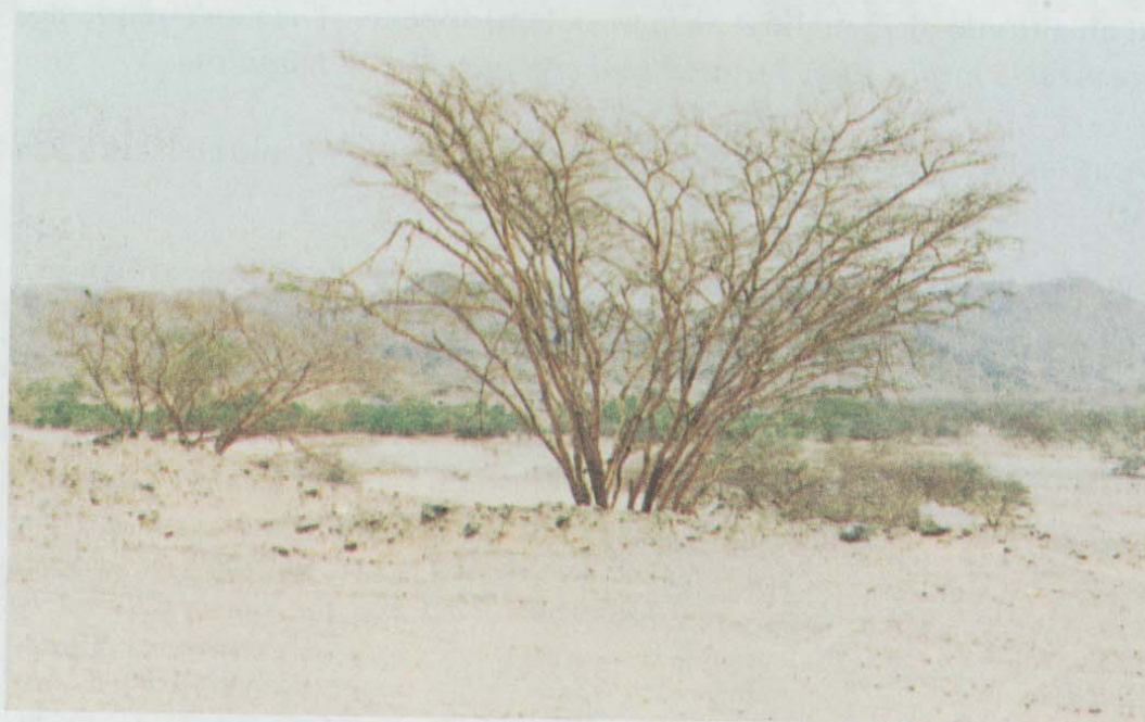
Fig. 3. Acacia tortilis (Forssk.) Hayne at edge of wadi in vicinity of Muzailef