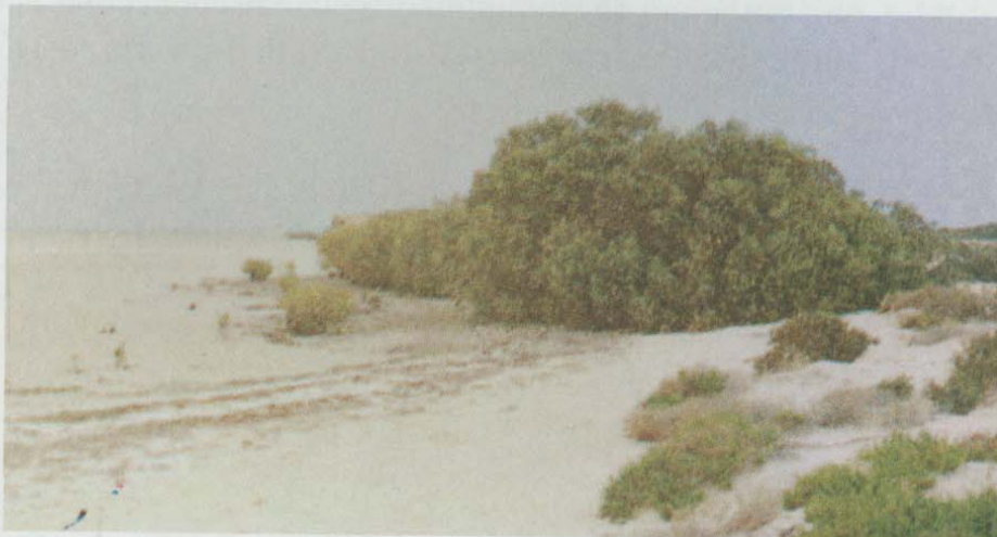
Fig. 1. Avicennia marina (Forssk.) Vierh. with few halophytic species on coastal fringe

All herbarium specimens are kept in the Department of Botany and Microbiology. An alphabetical list of taxa recorded along the motorway is given in the Appendix.