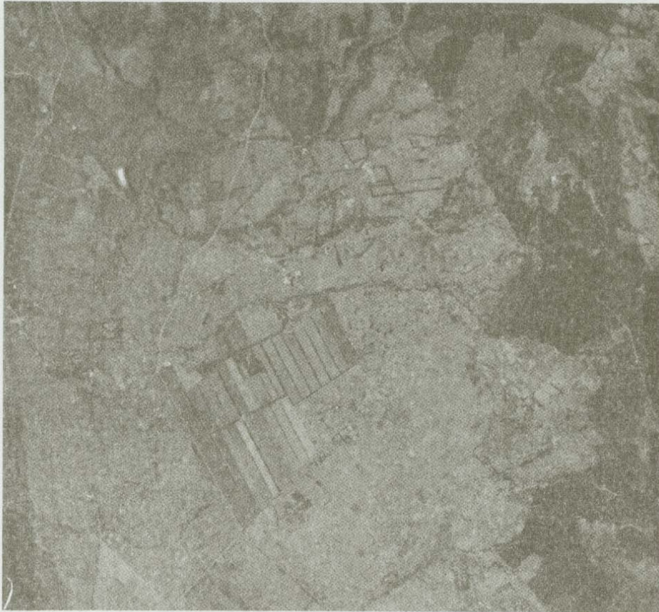
Fig. 1. Subimage of the test area.

sample values present in the new grid were estimated by interpolation of original data using the cubic convolution resampling technique. It appeared that the 3 \text{ m} \times 3 \text{ m} resampling did not introduce significant loss in positional accuracy (root-mean-square error of around 0.1 pixel).