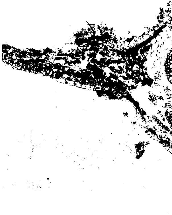
Fig. 3. Cross section of inoculated detached leaves of "Anici" cultivar showing the development of acervuli on, both, upper and lower surfaces of the leaf

place and cells, in infected areas, shrivelled and disintegrated. Well developed acervuli became quite obvious in which long, stiff pointed, and dark setae were interspersed with the conidiophores (Fig. 2d). Although acervuli were more distinct on the upper surface of infected leaves they did, also, occur on the lower surface (Fig. 3).