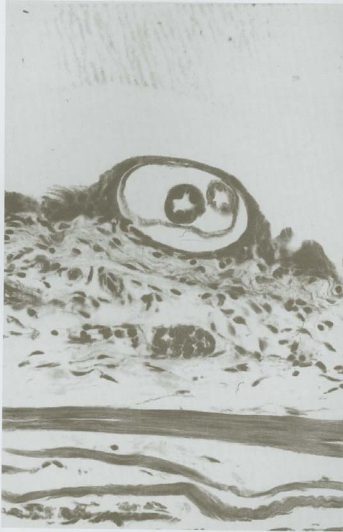
Fig. 3. Juvenile worms under normal epithelium of the urinary bladder provoking no tissue reaction. (H&E x 250).