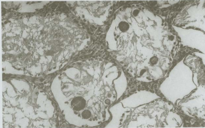
Fig. 4. Juvenile worms in degenerate seminiferous tubules of the testis. H&E x 250.

There were no hemorrhages in the examined lungs, which showed that no penetration of blood vessels by the parasite had taken place. Only remnants of dead worms were seen in the inflamed lungs and no intact worm bodies were seen. Parasites that migrate through the blood stream usually produce severe lesions in various organs especially the liver and are likely to cause inflammation at the site of their exit from tissue to blood and vice versa . In the present investigation, no such lesions were seen in the kidneys.