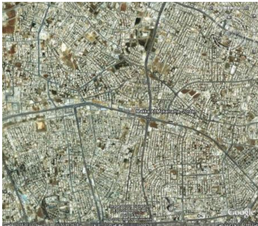
Fig. 1. Location of Mecca Mall and City Mall in Greater Amman.

Mecca Mall was the first large shopping mall to be built in the 21st century in Greater Amman. It was constructed in 2002 and recently completed its new extension in 2006. It is located (Fig. 1), as are all other shopping malls, in the western side of Greater Amman, in a relatively high-quality residential district (Figs. 2 and 3). City Mall is the second mall to be built in the 21st century in Amman. It is completed in 2008 and is located only 600 meters west of Mecca Mall, in a residential area (Figs. 4 and 5). Mecca Mall and City Mall together occupy around 4.7% of all retail building space in Greater Amman, around 80.6% of the total retail architecture in Bangkok, and around 45.8% of the total retail architecture in Greece. These two case studies of retail area in Greater Amman provide 0.15 square meter per person. Compared to other cities in Asia, it is among the highest rates. The retail area in Amman is obviously beyond the required when comparing it to other cities in the world. This will raise the question of the bad effect of these large retail areas on the Jordanian economy.