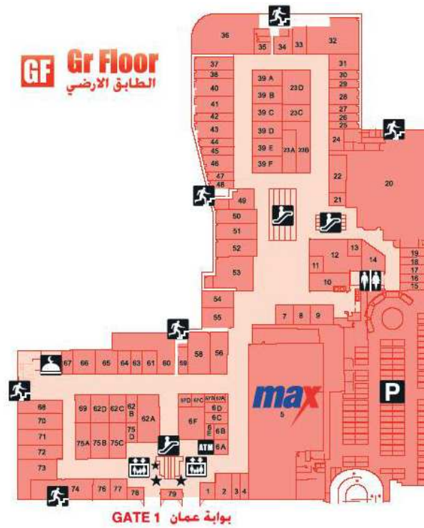
Fig. 2. Plan of Mecca Mall. Approx. Scale: 1:2000.