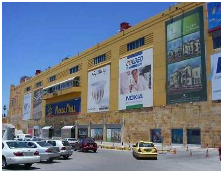
Fig. 3. Perspective of the main façade of Mecca Mall.